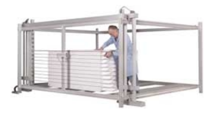
MW 2500 Medium with TurnTable and Lathe